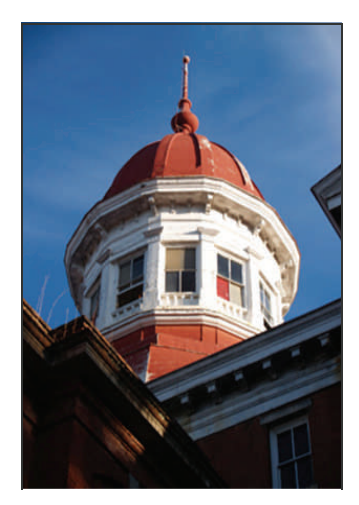
Babcock Building Cupola

DMH Mission: To support the recovery of people with Mental illnesses.