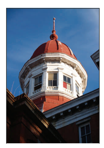
Babcock Building Cupola

DMH OPERATES A NETWORK OF SEVENTEEN COMMUNITY MENTAL HEALTH CENTERS, 42 CLINICS, FOUR HOSPITALS, THREE VETERANS' NURSING HOMES, AND ONE COMMUNITY NURSING HOME.